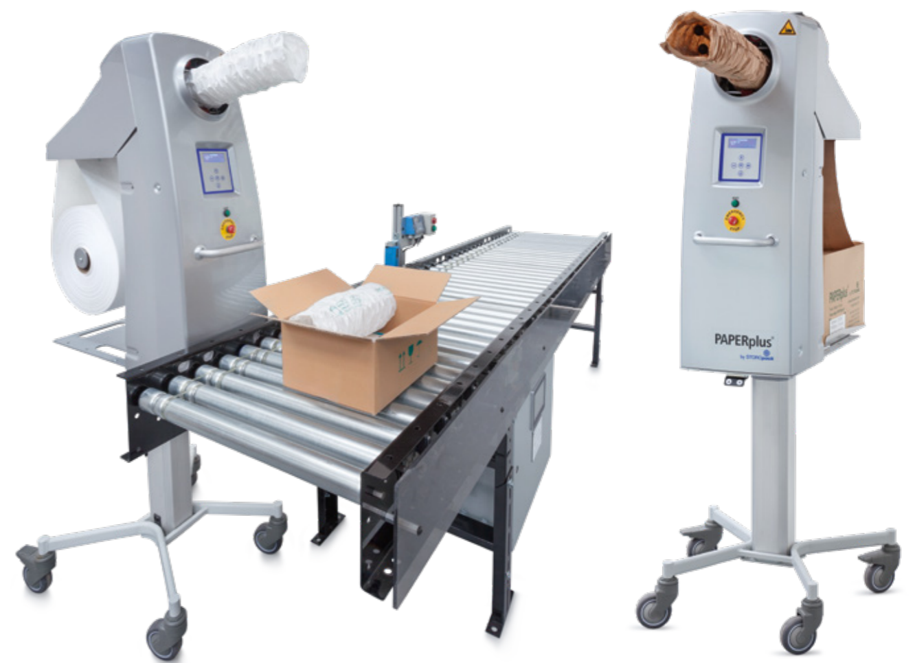
PAPERplus® Chevron 3