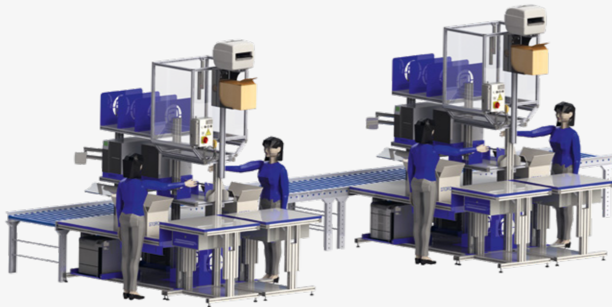
For comfortable and ergonomic work: Working Comfort® solution with PAPERplus® Papillon