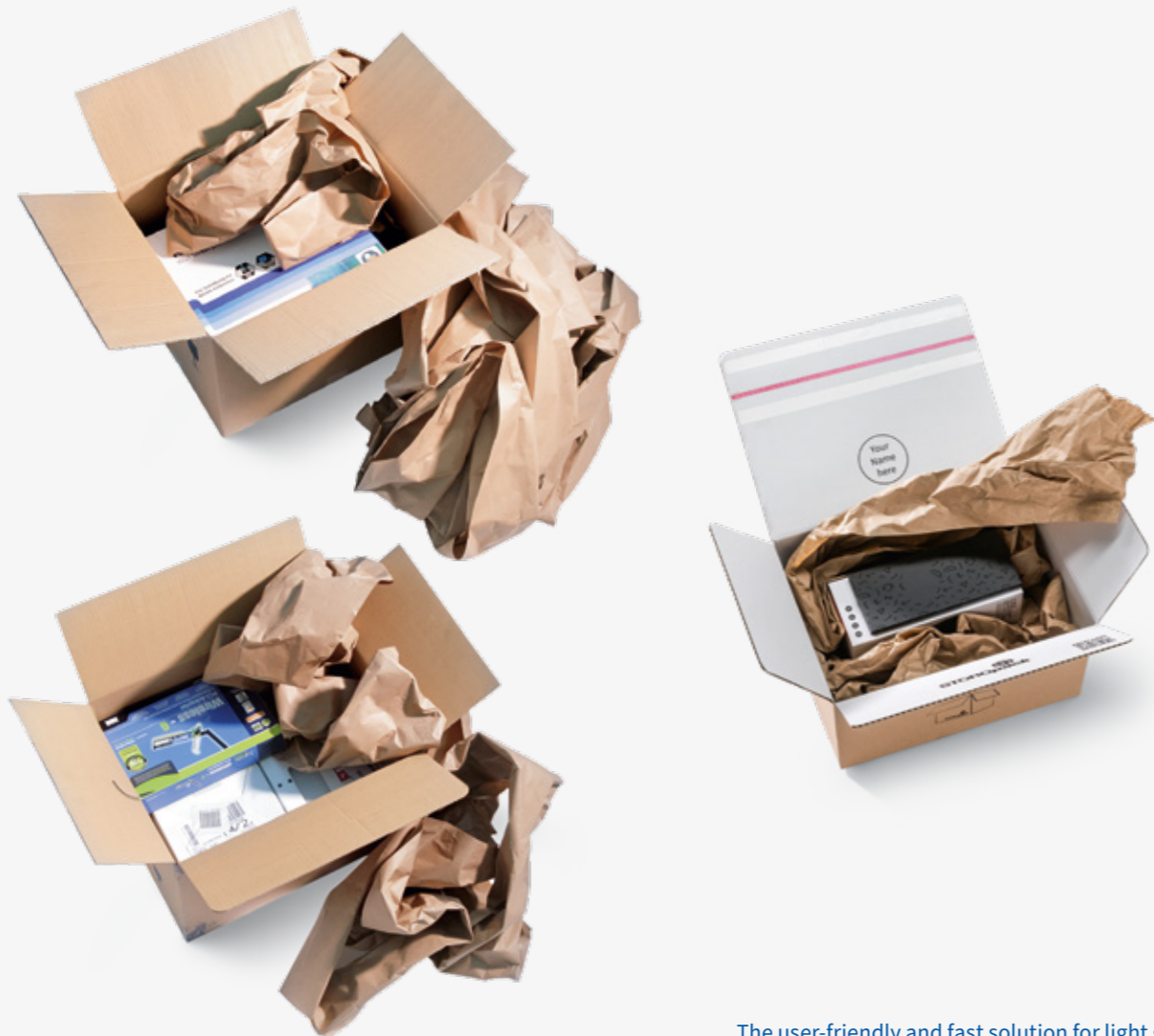
The user-friendly and fast solution for light goods: PAPERplus® Shooter for void fill