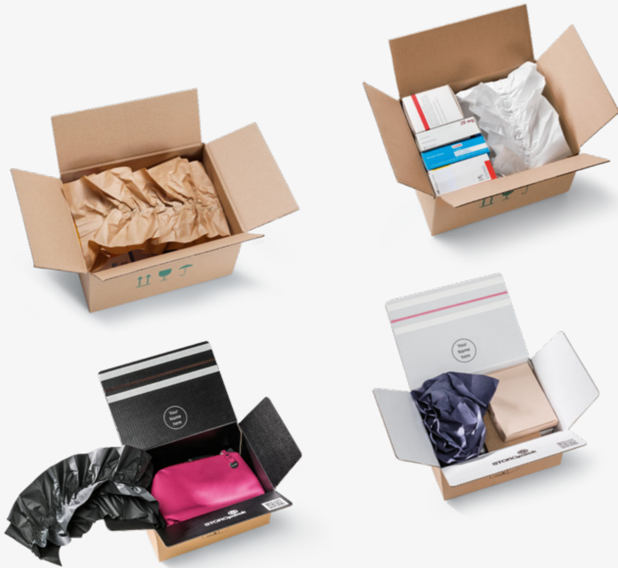
The compact solution for medium-weight to light items: PAPERplus® Papillon for void fill and wrapping