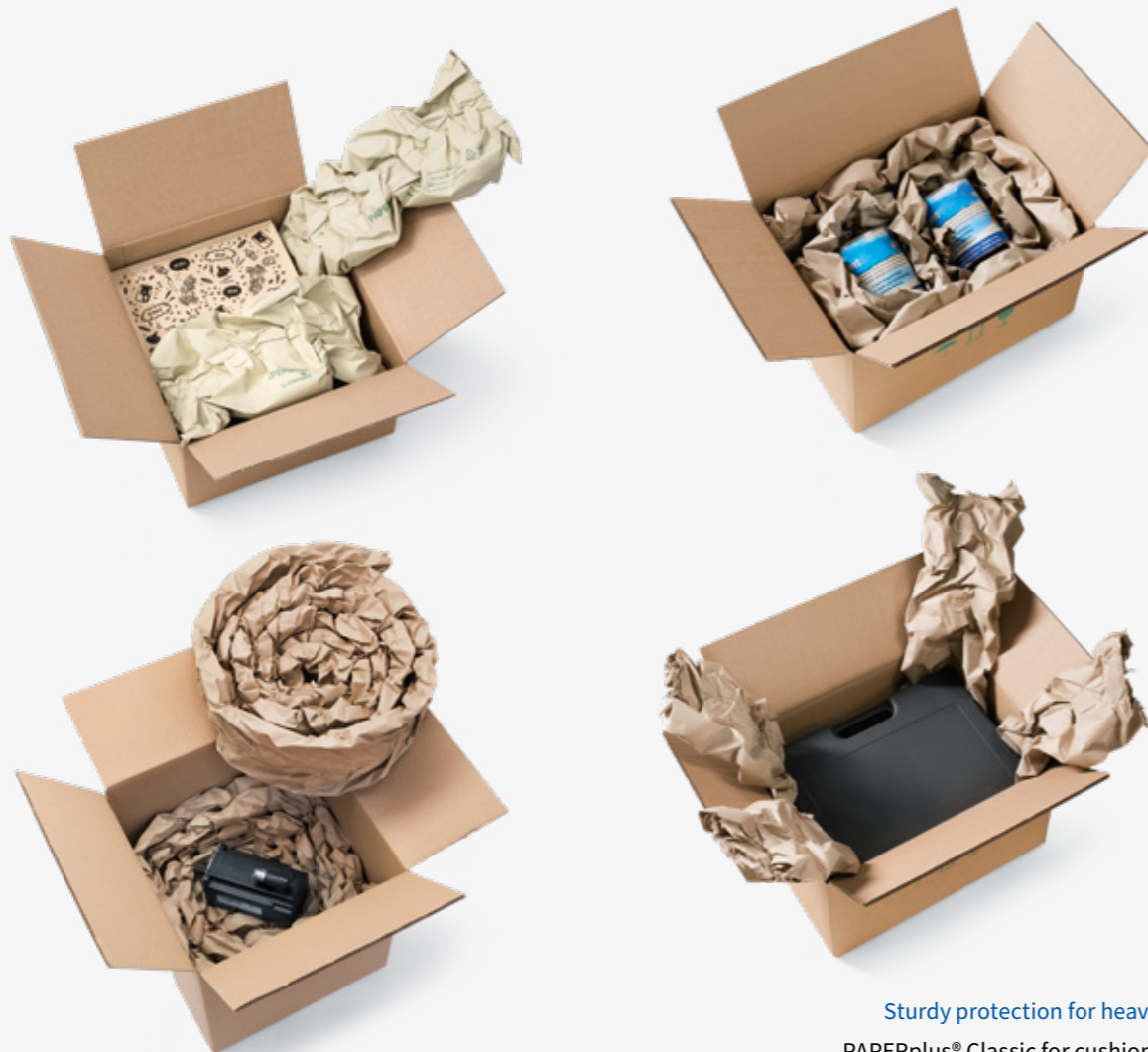
Sturdy protection for heavy items: PAPERplus® Classic for cushioning and block and brace applications